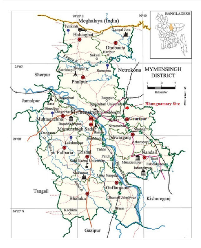
Figure 1. Site of the on-farm experimentations