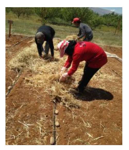
Figure 3. Placing and spreading straw mulch on potato in no-till treatments.

The data collected included the minimum and maximum soil temperatures at 20 cm depth for till treatment and at 0 cm soil surface for the no-till straw (Under the mulch treatment), number of plants in the middle two rows, shoot height (10 plants/plot), shoot number (10 plants/plot), the number of leaves (6 plants/plot), root and shoot dry weight (two plants from the edge rows), and yield quantity