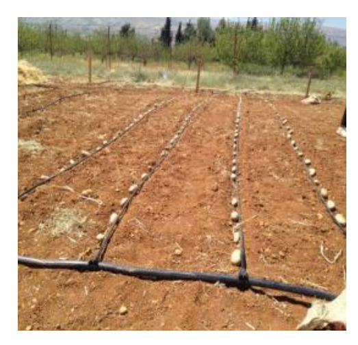
Figure 2. Placing potato tubers on the soil surface in no-till treatments.

in the field. The atmometer mimics alfalfa-reference evapotranspiration crop coefficients for potatoes were applied as per Allen [10] to determine crop evapotranspiration for the different growing stages of the crop. Granular fertilizer (15-15-15) was added to the soil surface, prior to planting at a rate of 500 Kg/ha using the band application method. Complimentary amounts of soluble fertilizers (20-20-20) were added in the drip irrigation systems every 15 days at a rate of 100 Kg/ha.